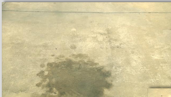
1. Oil Stain