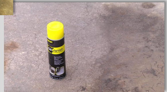
5. Before & After